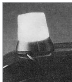
MAGNETIC BASE MODEL